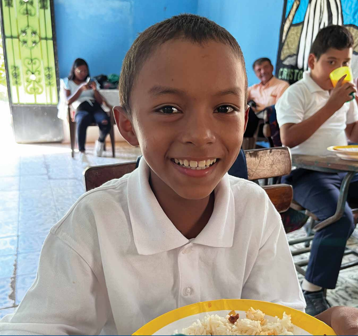
Bread of Life Feeding Program in Somotillo, Nicaragua.