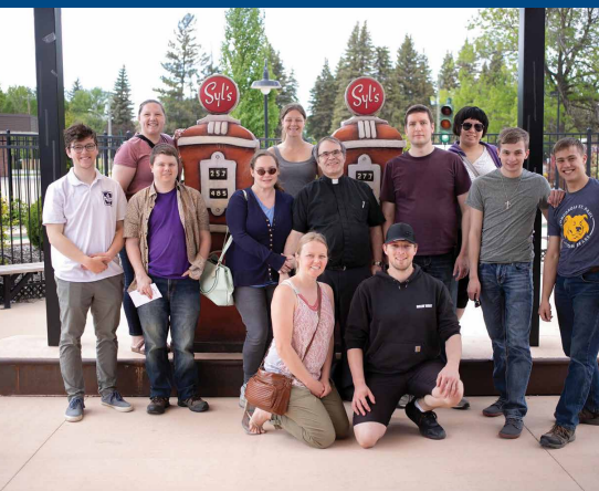
Young Adults Retreat at Trinity Lutheran Church in Winkler, MB.