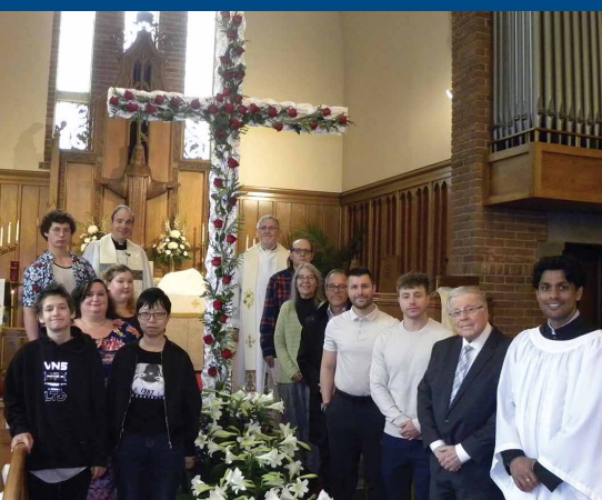
First Lutheran Church welcomes new members in Windsor, ON.