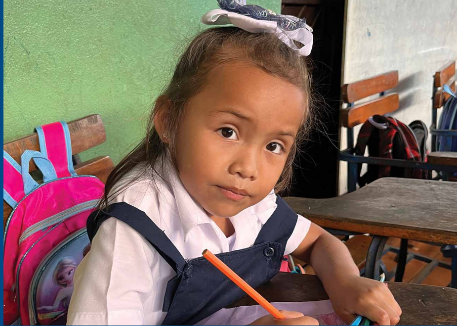
Lutheran Day School in Santa Patricia, Nicaragua.