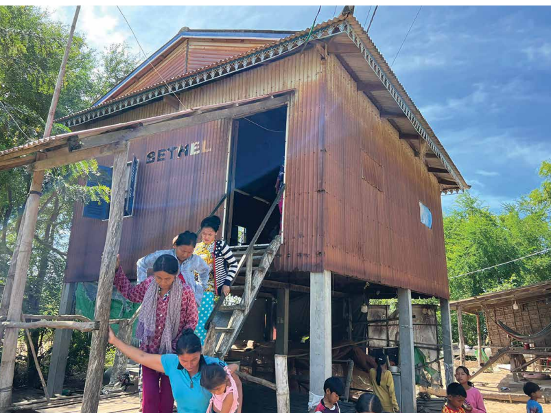
House church outside of Prey Veng in Cambodia.

By the grace of God, the Church is ever in motion—called, sent, and sustained by the Living Christ to bring His life-giving Gospel to those He sends us to serve. Over the past year, our international mission work has borne witness to the truth that “the Word goes forth” and that His promise never returns void. It has been a year filled with many trials, yet overflowing with the mercies of Christ. Across continents and cultures—from remote villages in Central America to bustling cities in Southeast Asia—we have seen the love of Christ break into lives: feeding the hungry, nurturing young hearts, raising up new servants of the Word, and gathering His people into His Church.