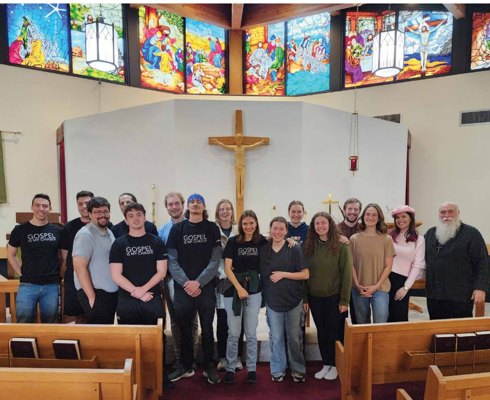
East District Lutheran Young Adults (EDLYA) Retreat at St. Paul's Lutheran Church in Cobourg, ON.

Likewise, the Colloquy program has expanded, welcoming immigrant pastors and those from other denominations who are drawn to LCC's confessional clarity and faithful doctrine. This growth is another exciting response to our PPP call to equip leaders through multiple pathways, and we are encouraged to see increasing numbers of pastors inquire each year. Truly, God is supplying His Church with pastors!